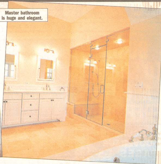
Master bathroom is huge and elegant.