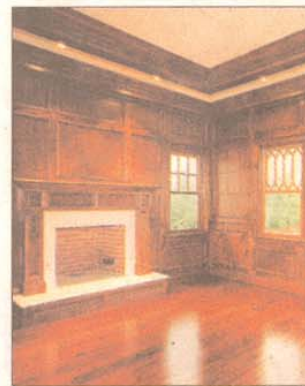
Paneled library is one of highlights of home, which also has pool and gym with steam room and sauna.